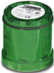
LED permanent light element, 24 V AC/DC, green

Please be informed that the data shown in this PDF Document is generated from our Online Catalog. Please find the complete data in the user's documentation. Our General Terms of Use for Downloads are valid ( http://phoenixcontact.com/download )