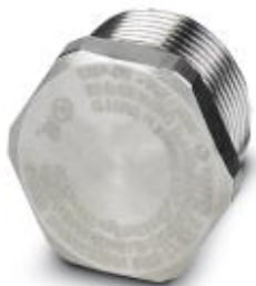
Screw plug, Nickel-plated brass, Application: Ex, Connecting thread: M32, Color: silver

Please be informed that the data shown in this PDF Document is generated from our Online Catalog. Please find the complete data in the user's documentation. Our General Terms of Use for Downloads are valid ( http://phoenixcontact.com/download )